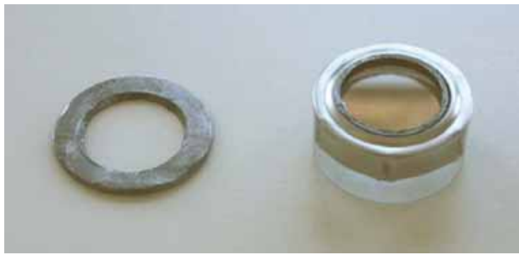
REPAIR KIT ASSEMBLED