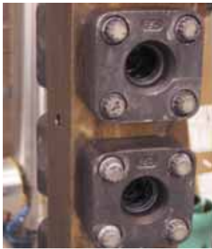
PORTED VISUAL LEVEL GAUGE

Fossil Power Systems' offers several Ported Boiler Level Gauge Repair Kit configurations to fit Fossil and Yarway gauge designs. All repair kits use the very best high quality materials and are rated for 3000 psi saturated steam service.