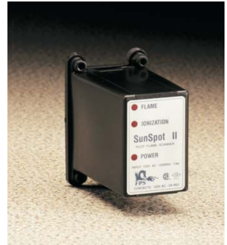
SUNSPOT II PILOT FLAME DETECTOR MODULE