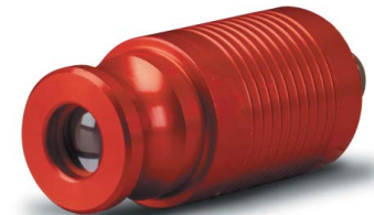
SPECTRUM UV SCANNER HEAD